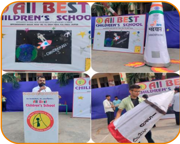
Celebration of successful landing of Chandrayaan-3