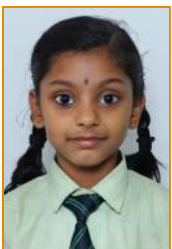
1st Shivanya 99.37%