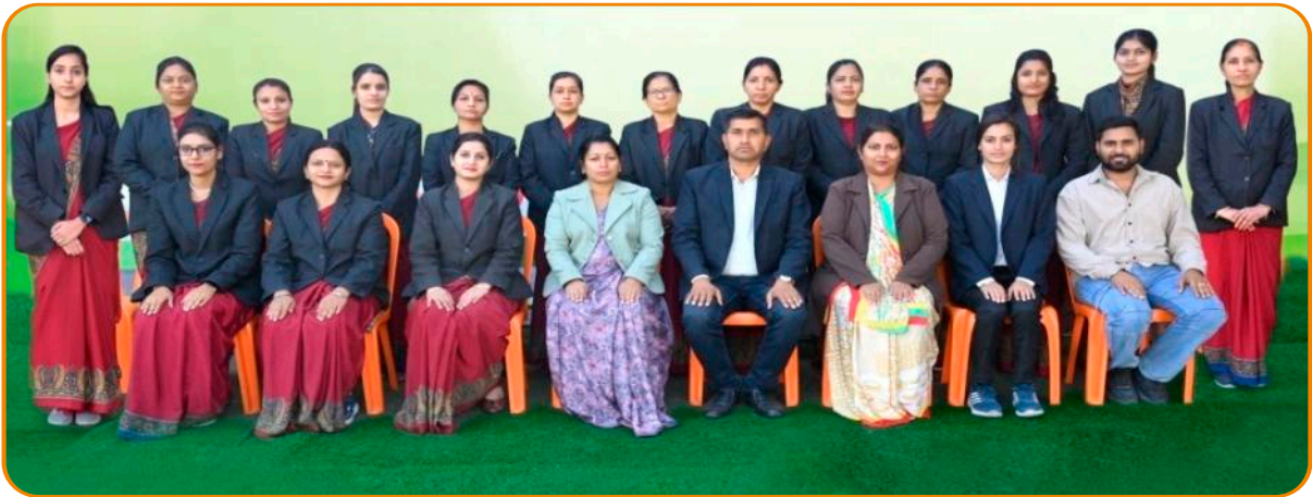
PRIMARY WING STAFF