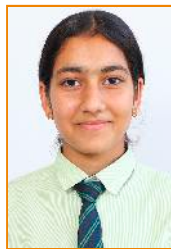
2nd Chahat Maan 93.25 %