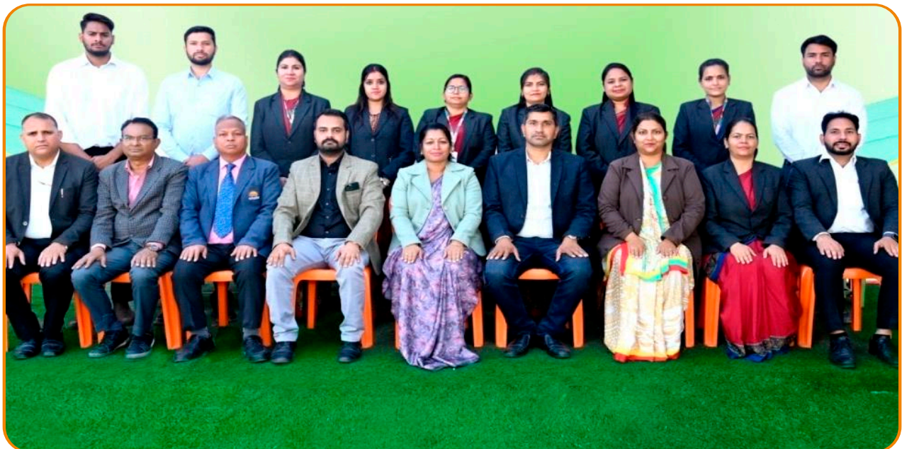
SENIOR WING STAFF