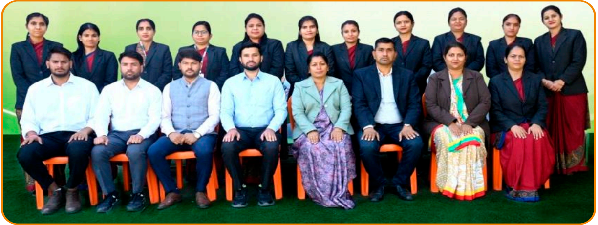
MIDDLE WING STAFF