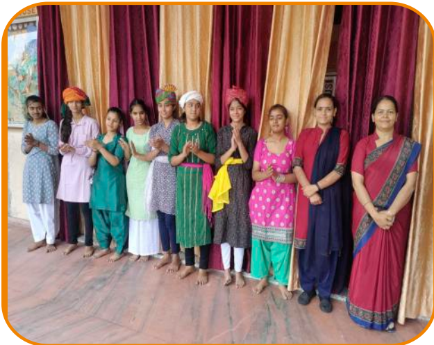
International Labour Day