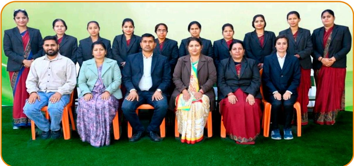
PRE-PRIMARY WING STAFF