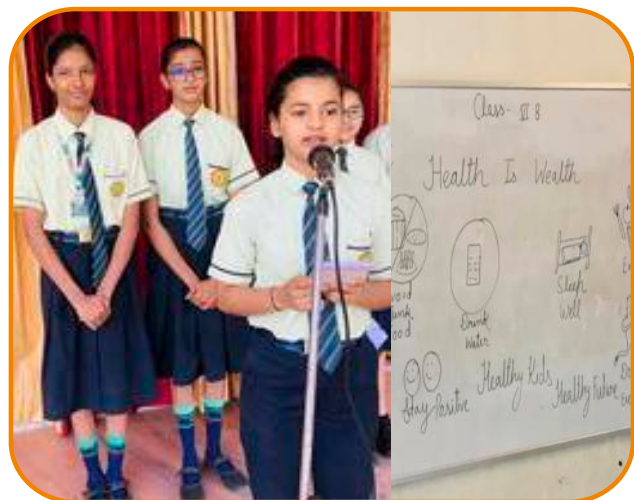
World Health Day