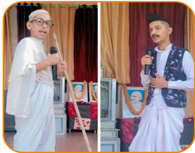
Gandhi Jayanti and Lal Bahadur Shastri Jayanti